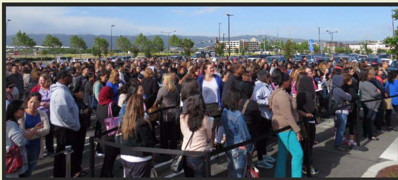
A crowd of shoppers eagerly await the grand opening of Nordstrom Rack on Thursday, May 7.

Nordstrom Rack is now open Monday through Saturday, from 10 AM to 9 PM, and Sunday 11 AM -7 PM.